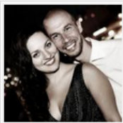
My 13 Best Travel Moments of 2013