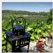
Istria: The Best Kept Secret in Croatia