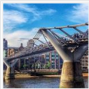
Monthly Recap: Most-of-May 2014