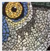
Travel Blogs: Best of the Week