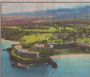
Sheraton Maui Resort & Spa

Find bargains on hotels, airfares and packages at latimes.com/travelblog .