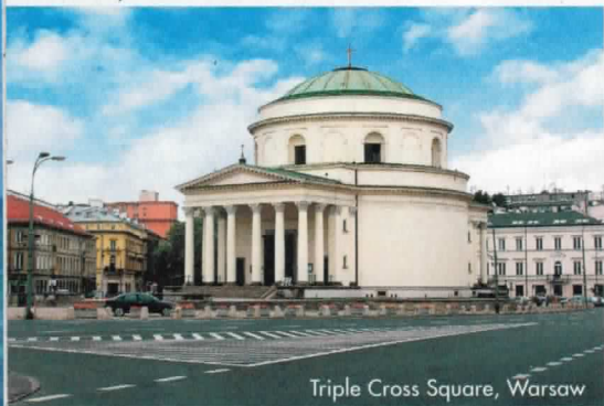
Triple Cross Square, Warsaw

HERE ARE some of the latest developments of interest to agents from tour operators, cruise lines and airlines.