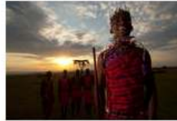
On safari with Extraordinary Journeys Extraordinary Journeys

Extraordinary Journeys is run by a mother-daughter team with more than 40 years of combined safari knowledge. The company offers several intriguing trips with special spins for adventurous travelers.