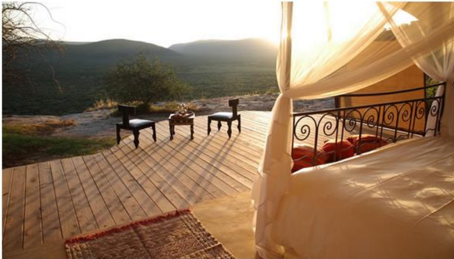
Saruni Samburu in Kenya.

Safaris can be more than just game drives and walks in the bush. These itineraries from Africa to Australia give a new meaning to the term safari.