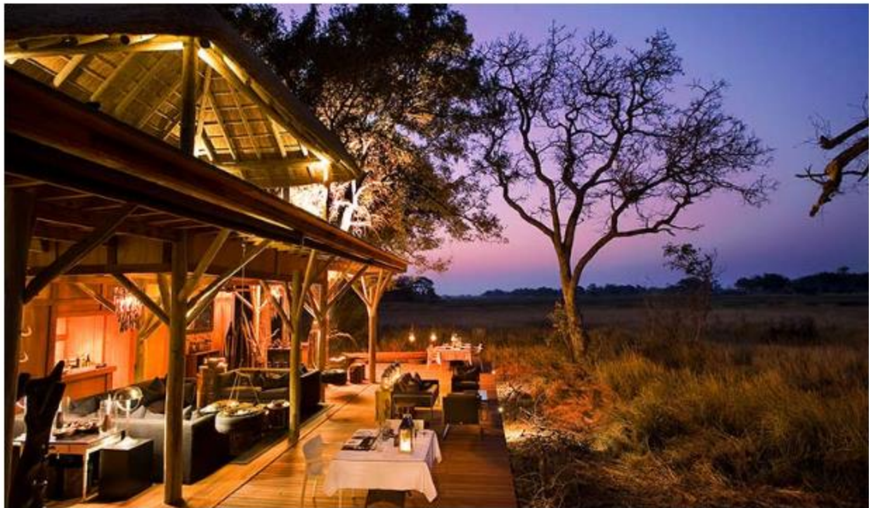
The guest area at Xudum Delta Lodge in Botswana