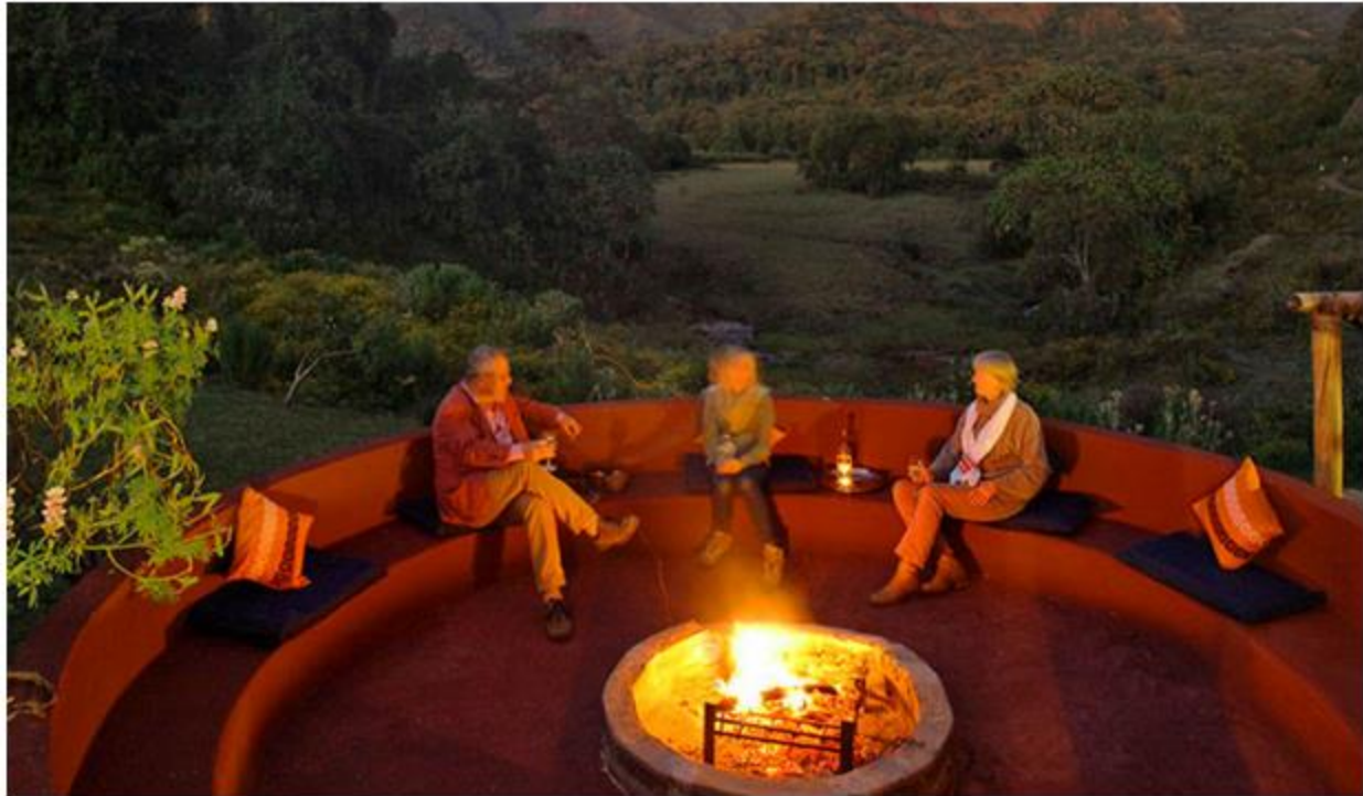
Bale Mountain Lodge

Wildlife: Botswana boasts the world's largest inland delta, the Ohavango, perfect for exploring by dugout canoe and packed with giraffe, elephant, lion and cheetah; the Moremi Game Reserve, a 'Big Five' favourite populated with white and rare black rhino and the hippo-friendly waters of Chobe National Park, home to 1.2 lakh elephants.