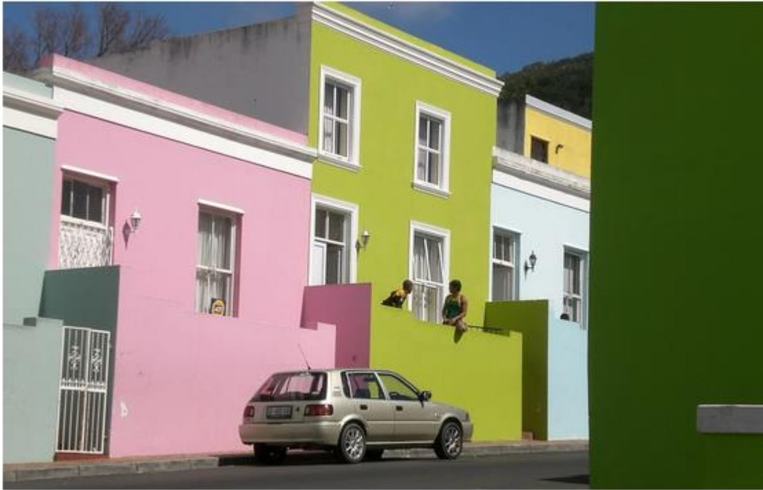
Bo-Kaap is world-famous for its pastel-painted homes.

For the greater experience of Bo-Kaap, check out the small Bo-Kaap Museum, built in 1768 in early Cape Dutch style, for Islamic culture and heritage. Its unassuming facade seems almost out of place among all that splashy color. Seeing the exhibits takes only an hour or so, but the highlight is a series of historical black-and-white and sepia-toned photos titled “Who Built Cape Town?” that depict primarily the Muslim lifestyle of the Bo-Kaap neighborhood.