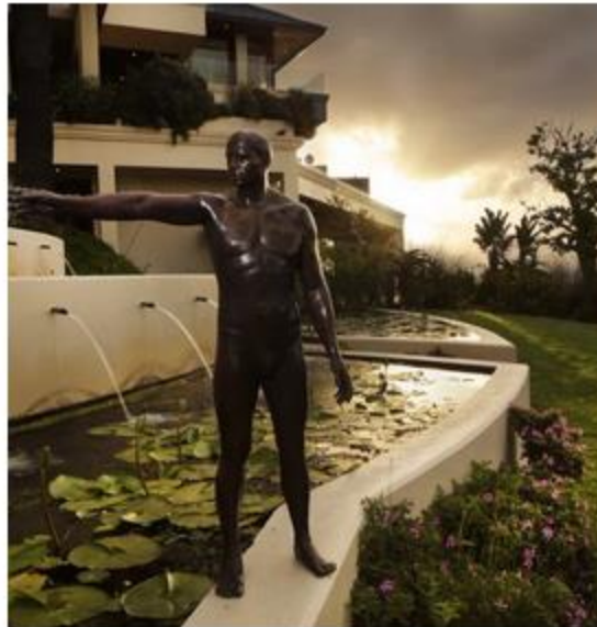
The Ellerman House's extensive art collection raises the question, "Is it a hotel within an art gallery, or an art gallery within a hotel?"

Peel away the layers of just about every painting, piece of pottery or jewelry, or handcrafted sculpture or ceramic, and you'll find a story of emotion, history and nature. You see it in places like the Ellerman House, museums