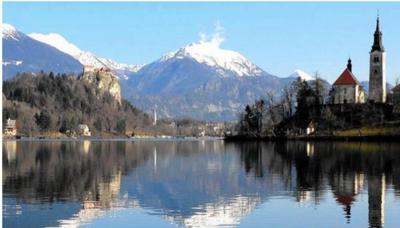
Bled, Slovenia, is on the itinerary for the Jewels of the Adriatic: Croatia & Slovenia tour.