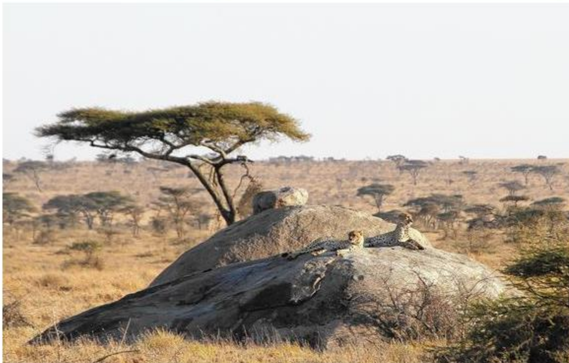
Cheetahs relaxing atop a Kopje in Namiri Plains. (Asilia Africa / September 9, 2013)

Comments Share 0 g+1 0 Tweet 0 Recommend 0