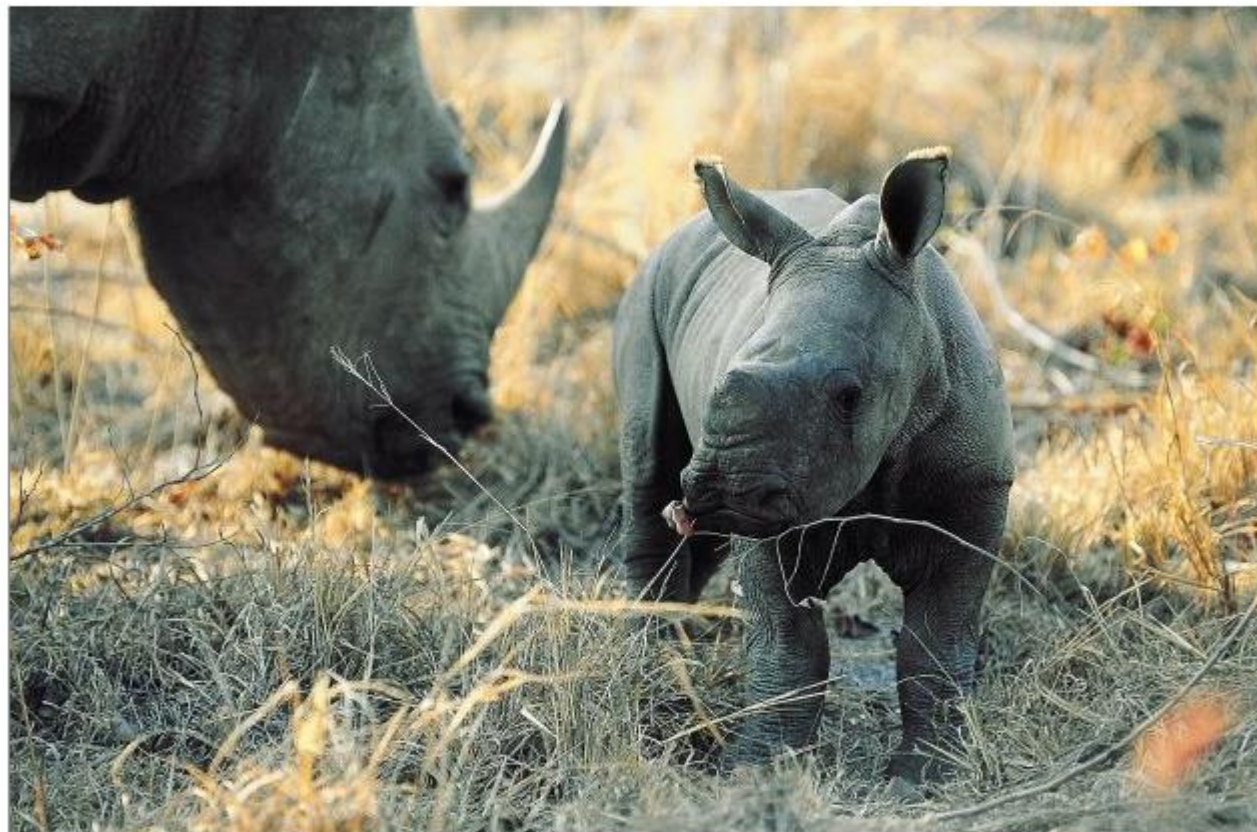
White rhinos are among the diverse wildlife at South Africa's Sabi Sabi Private Game Reserve.