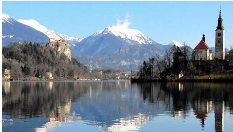
Bled, Slovenia, is on the itinerary for the Jewels of the Adriatic: Croatia & Slovenia tour.