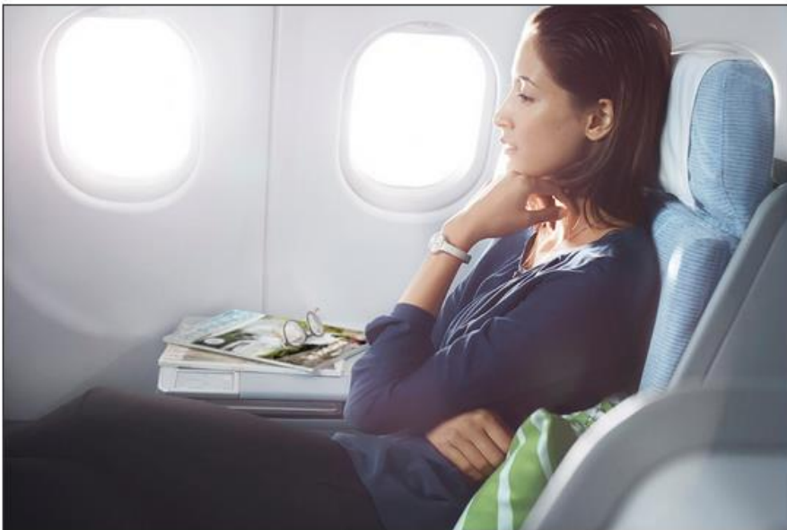
Finnair business woman

The Zodiac Seats UK Vantage model seats selected by Finnair are already in use on the airline’s four newest Airbus A330s. The seats are designed to provide a fully-flat bed measuring up to 79 inches (200 cm), while shoulder room measures 23 inches (58 cm). The fully adjustable seats also come with an individual reading light, adjustable head rest, mood lights and a range of inflight entertainment options.