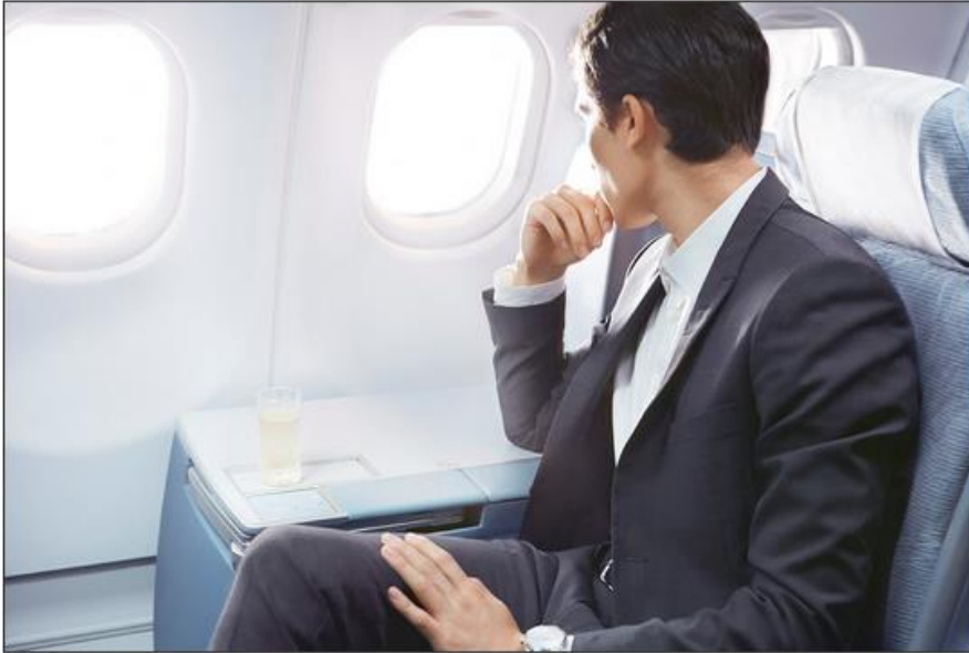
Finnair business man