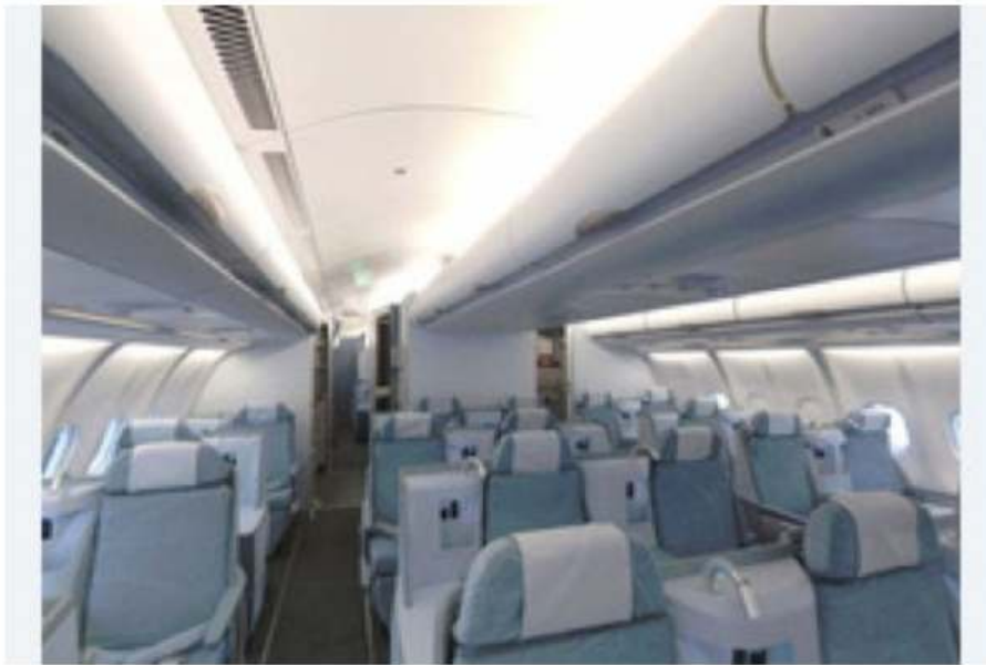
Finnair is joining the growing group of airlines who are incorporating social seating into the flight experience.

The national air carrier for Finland, Finnair, is beginning to use social seating.