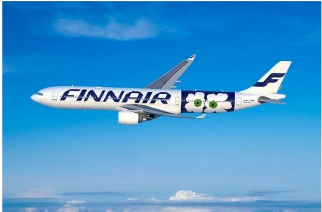
Finnair's new Airbus 330 will feature Marimekko's iconic poppy print.