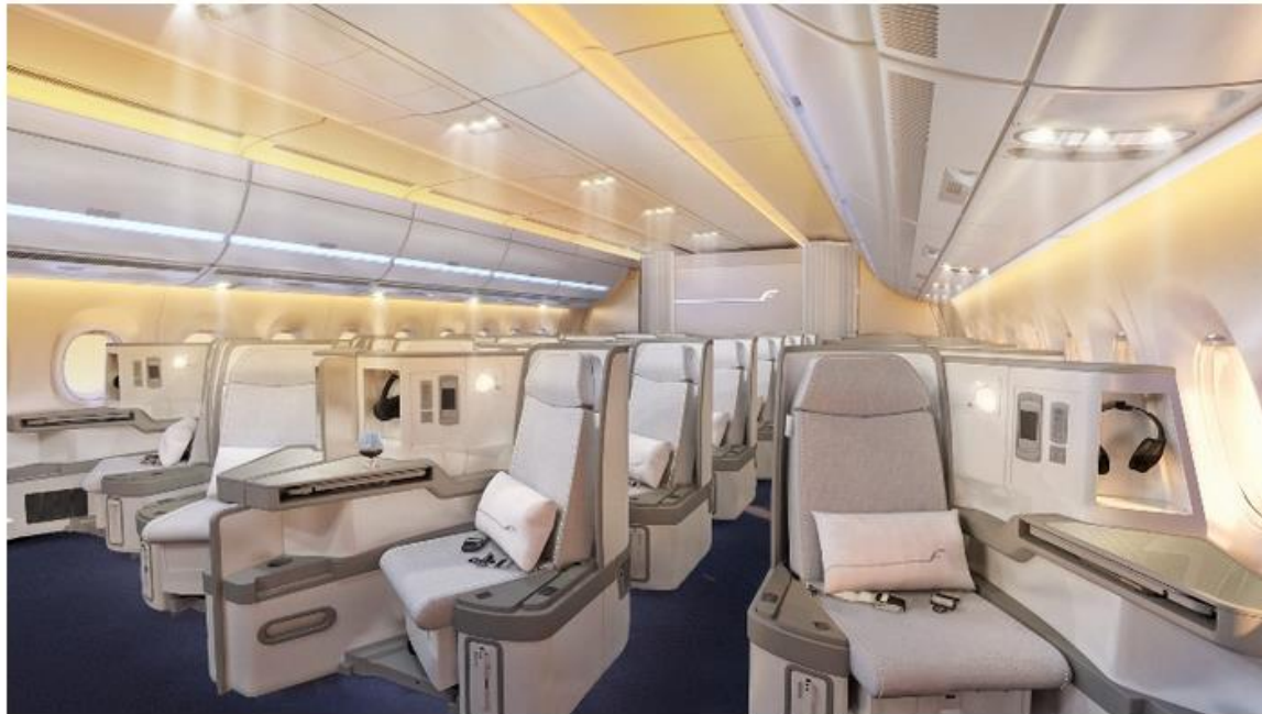
Business: The cabin is fitted with 46 Zodiac Cirrus III seats

The 297-seat configuration has 46 seats in business class, 43 in Economy Comfort and 208 in economy.