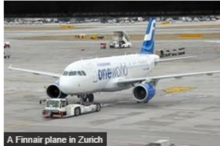
A Finnair plane in Zurich

Finnair announced plans to operate a non-stop long-haul flight from Helsinki, Finland to New York City on Wednesday using recycled cooking oil to power the engines.