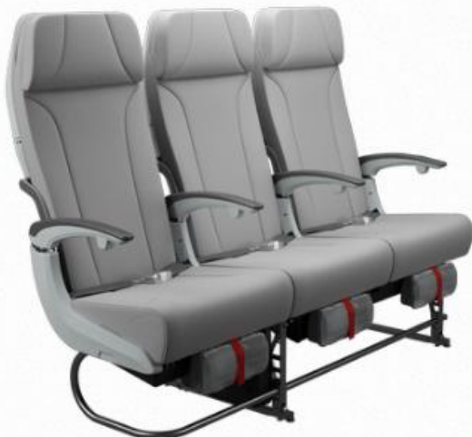
Finnair will use these Zodiac Z300 slim-line seats with a 6" recline in the coach class section of its new Airbus A350 aircraft.

All Finnair A350s will be equipped to offer Wi-Fi.