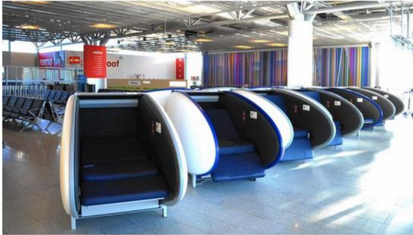
GoSleep pods in Helsinki are the first in a European airport. (GoSleep)