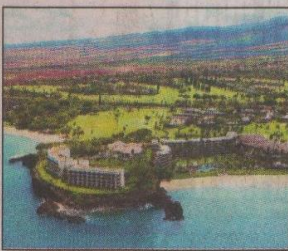
Sheraton Maui Resort & Spa

Find bargains on hotels, airfares and packages at latimes.com/travelblog .