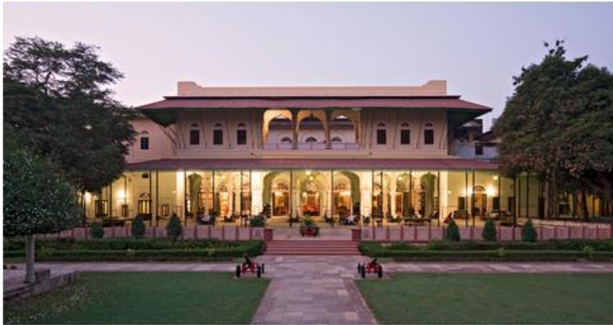
Castle Kanota is the set of the Viceroy Club in the film.

Geringer Global Travel is offering a 14-day Second Exotic Marigold Hotel itinerary, perfect for movie buffs who can follow in the footsteps of the cast in "The Second Best Marigold Hotel."