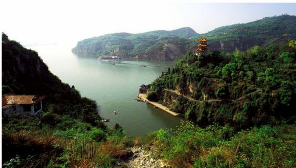
Pacific Delight Tours' Gold Experience China & Yangtze River tour.

Looking to earn bonus commission, free hotel stays and transportation credits? We've got you covered with this roundup of agent incentives.