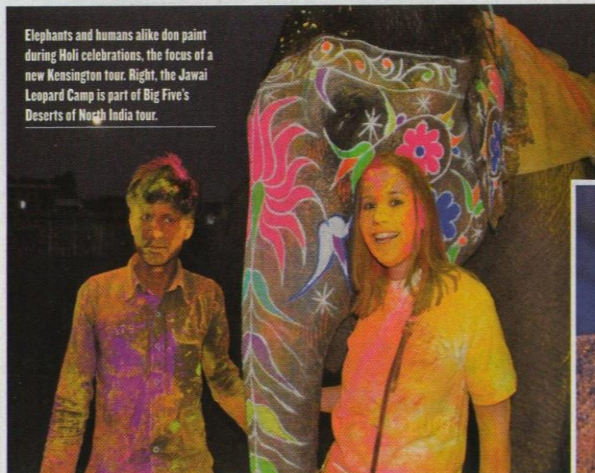
Elephants and humans alike don paint during Holi celebrations, the focus of a new Kensington tour. Right, the Jawai Leopard Camp is part of Big Five's Deserts of North India tour.