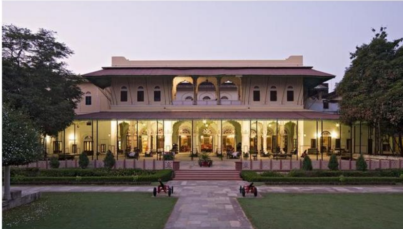
Movie fans may recognize Castle Kanota in Jaipur, India, as the set of the Viceroy Club in "The Second Best Exotic Marigold Hotel."