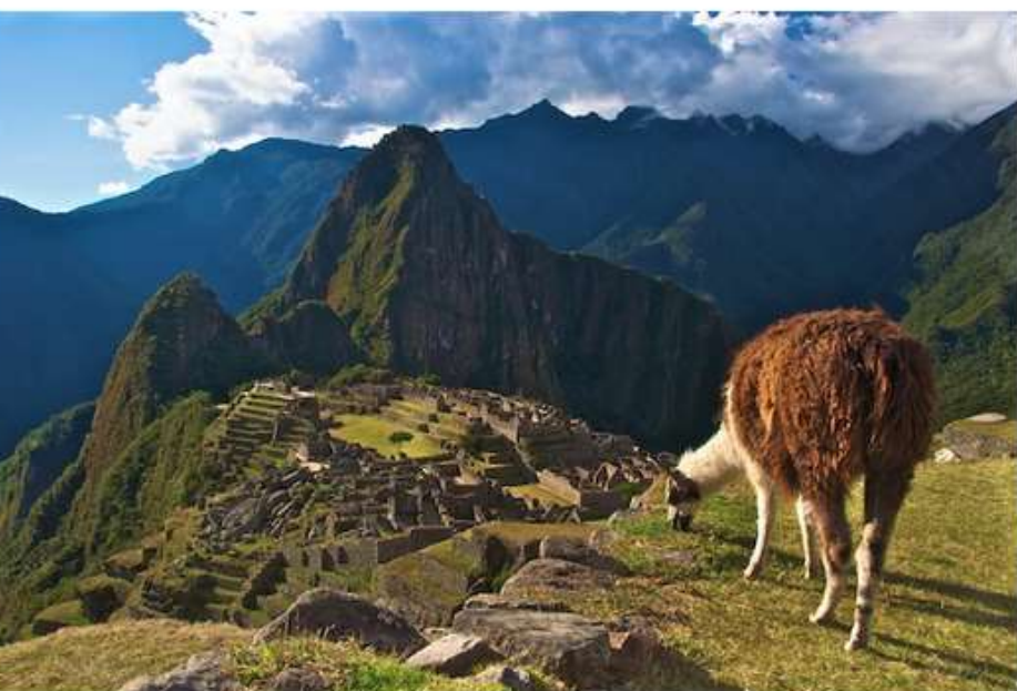
Machu Picchu

You never know, maybe we'll see you and the llama at the top of Machu Picchu! 🐫