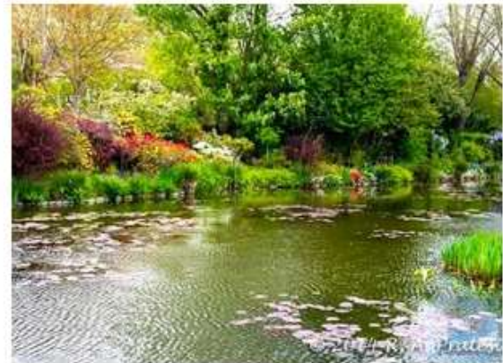
the sights and sounds of claude monet's giverny