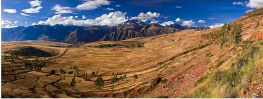
Sacred Valley

JourneYou is a travel company specializing in tours to South America and they have put together this truly spectacular trip that is very reasonably priced. If seeing Machu Picchu is on your bucket list, now may be the time to make travel plans to visit Peru! Here are the details: