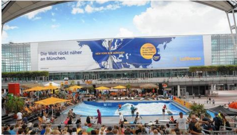
Surfers will be able to ride what's billed as the world's largest standing wave July 31 to Aug. 23 at the Forum of the Munich Airport.