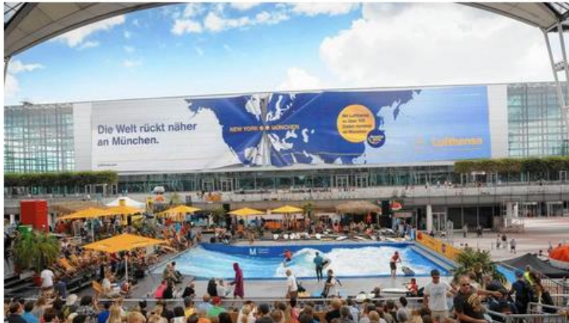
Surfers will be able to ride what's billed as the world's largest standing wave July 31 to Aug. 23 at the Forum of the Munich Airport.