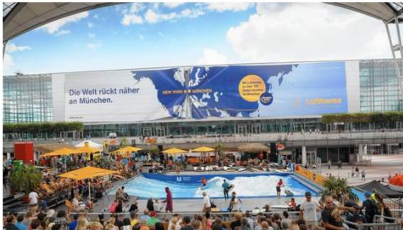
Surfers will be able to ride what's billed as the world's largest standing wave July 31 to Aug. 23 at the Forum of the Munich Airport.