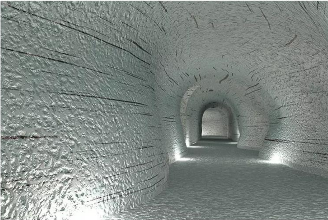
Take an 8WD vehicle into the frozen heart of West Iceland.