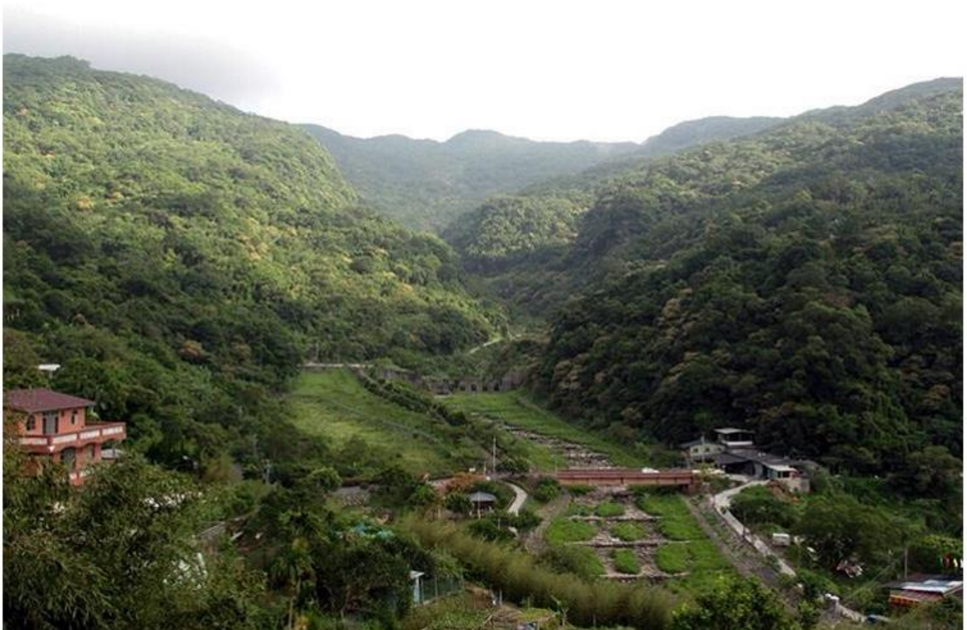
Fancy spending a few hours as a 'cross between Tarzan and a helicopter pilot'? Head for Taiwan's new zip-line extravaganza.