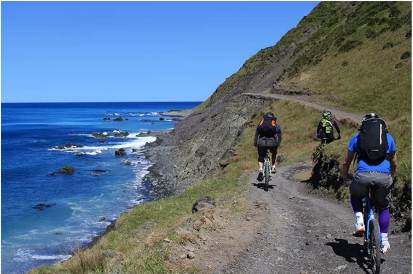
Explore urban and wild terrain - and take a side trip to wine country - on the Rimutaka Cycle Trail.