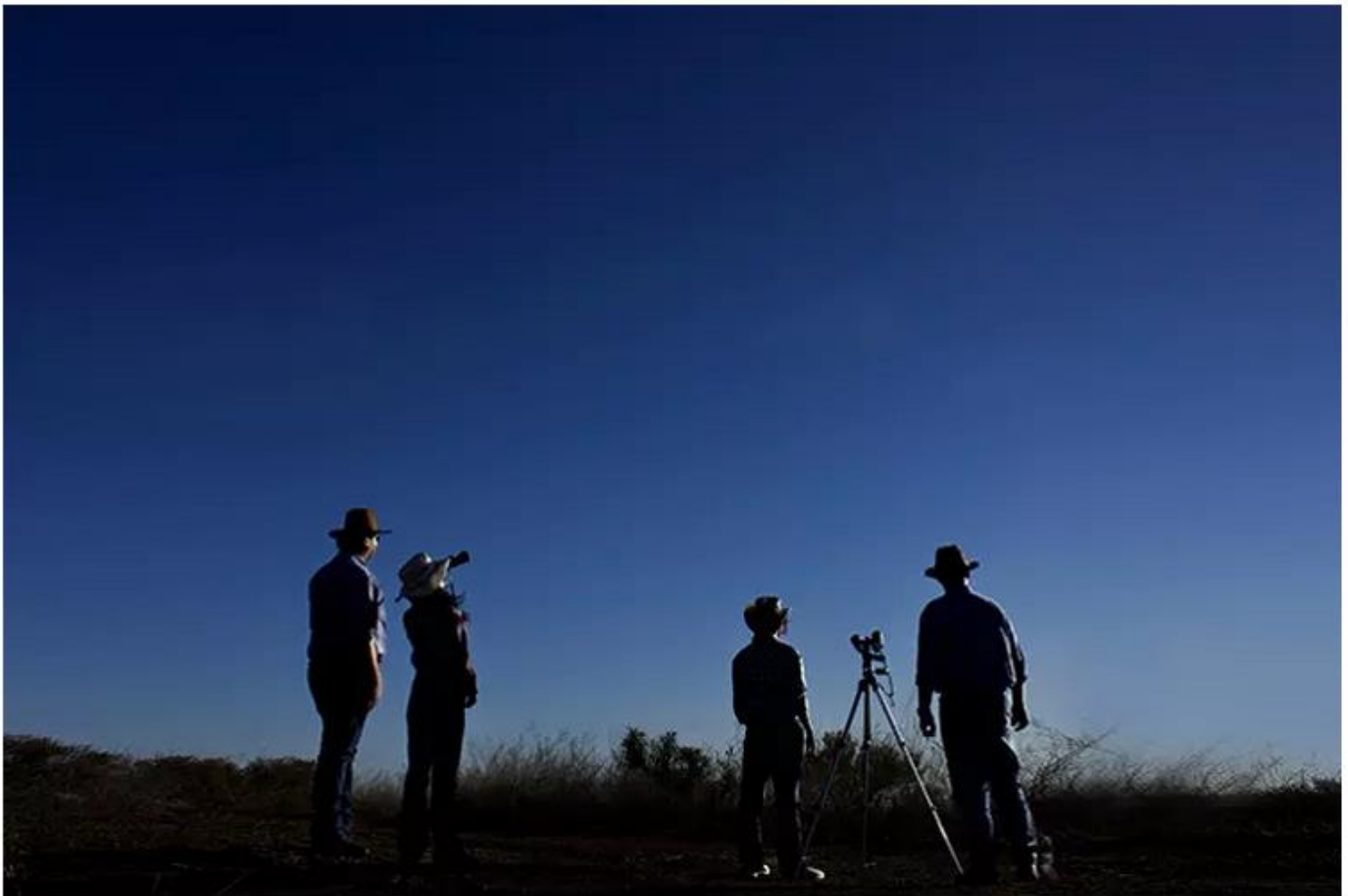
Marvel at the light pollution-free skies in the Red Centre of Oz.