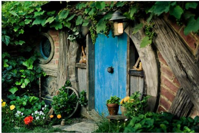
A stop along the way in a tour in New Zealand exploring the world of Tolkien characters.

It's dinner and a movie ... set. The Hobbiton Movie Set in New Zealand, as seen in the screen adaptations of J. R. R. Tolkien's "Lord of the Rings" trilogy and "The Hobbit," is offering night tours of Bilbo Baggins's homeland.