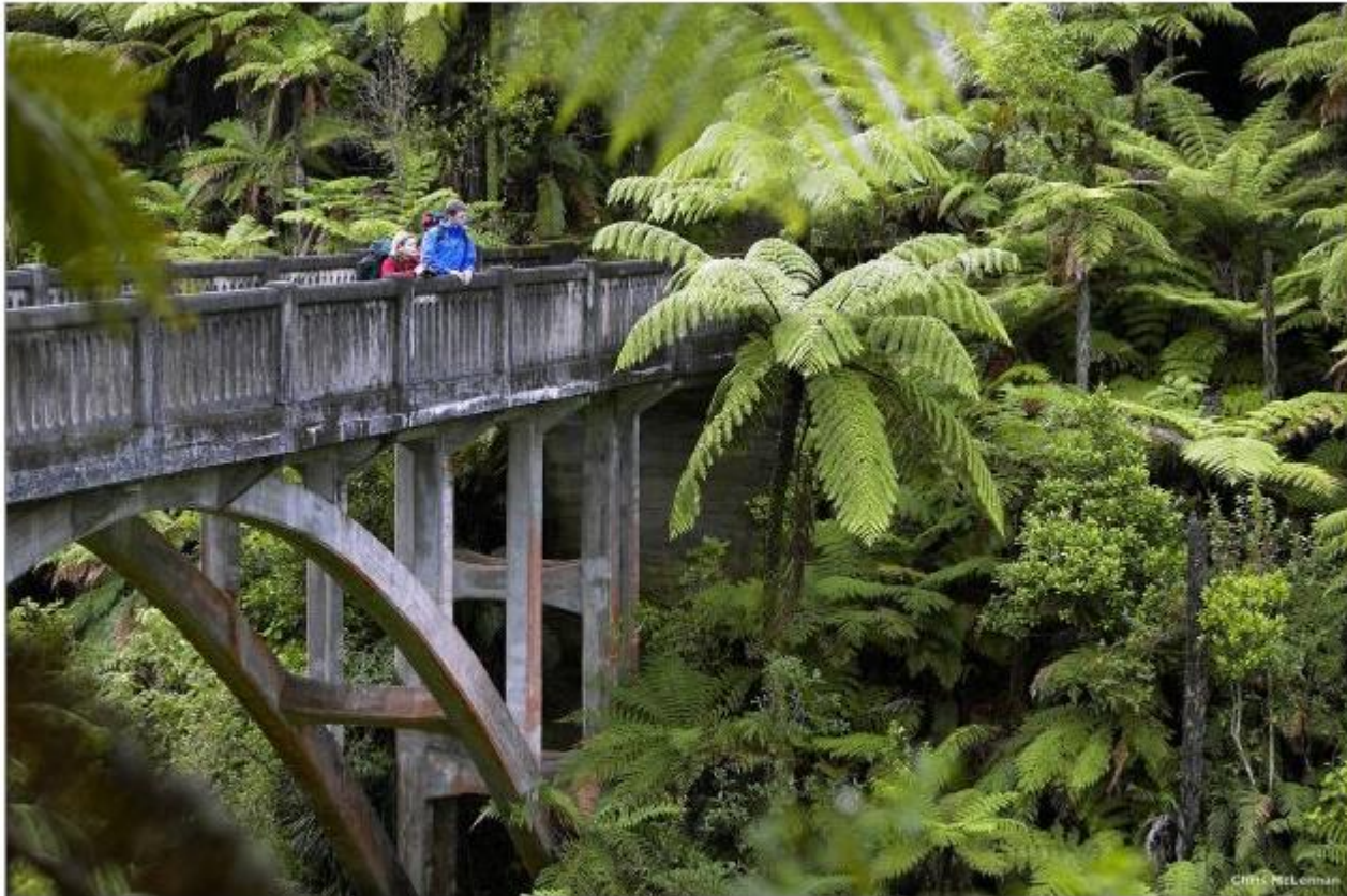
New Zealand's Whanganui National Park is home to the Bridge to Nowhere, a remnant of a long-abandoned settlement in a lush valley.