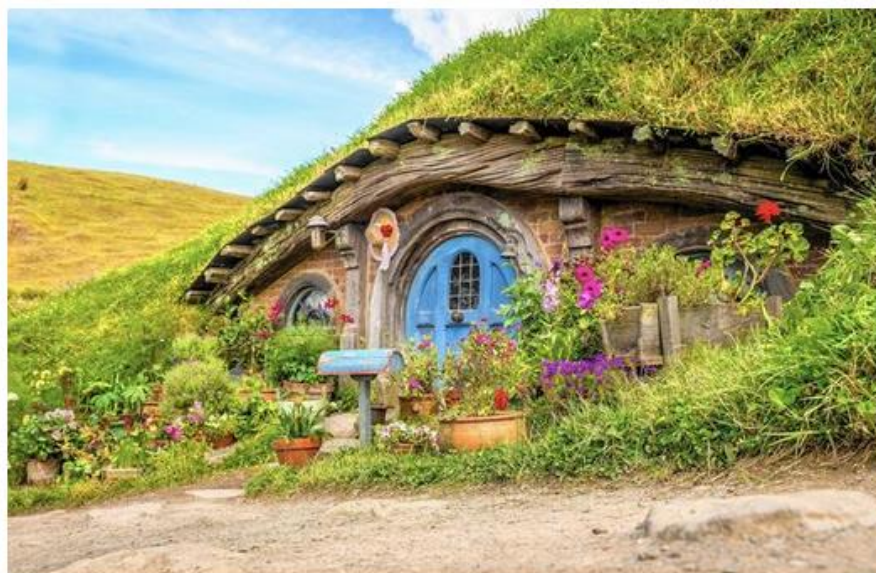
The Ultimate "Lord of the Rings" Tour takes visitors behind the scenes in New Zealand.

By Phil Marty, Special to Tribune Newspapers