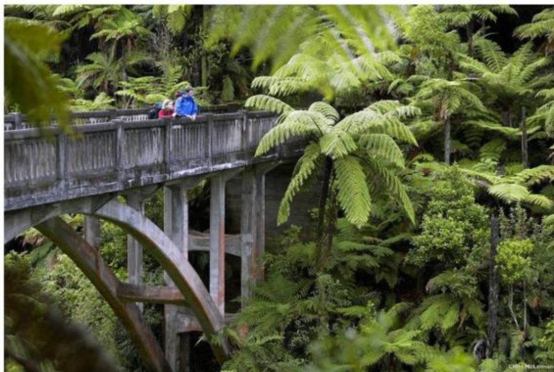
New Zealand's Whanganui National Park is home to the Bridge to Nowhere, a remnant of a long-abandoned settlement in a lush valley.