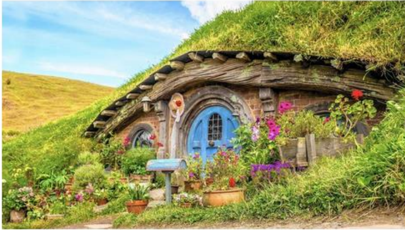
The Ultimate "Lord of the Rings" Tour takes visitors behind the scenes in New Zealand.

By Phil Marty, Special to Tribune Newspapers