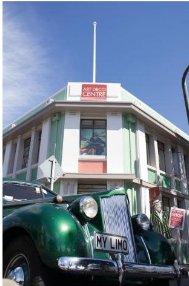
The city center of Napier, New Zealand, was rebuilt in largely Art Deco style following a 1931 earthquake.

Published 4:37 pm, Thursday, January 15, 2015