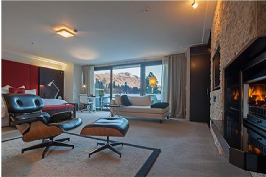
Inside the Spires

Eames lounge chairs are the focus of the suite, aligned with the gorgeous fireplaces—it encourages guests to relax. Generous balconies allow you to enjoy the morning sun in summer, or you can soak in the giant bath with the shutters opened to the suite, and take in the garden views from the tub.