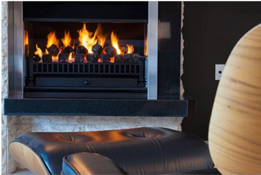
Inside The Spires

That warm, inviting feeling transcends throughout the property and into the suites. Of course, the intimacy is due in large part to The Spire’s size—there are just 10 rooms, each as elegantly decorated as the lobby. With so few guests, you’re almost always greeted on a first-name basis by a member of the staff. And don’t be surprised if the general manager offers to treat you to a round of drinks at No5 Church Lane, The Spire’s restaurant and bar. (If he does, be sure to order the Burning Man, a smoky bourbon cocktail perfect for a frigid evening.)