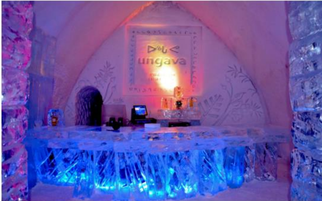
Hotel de Glace

Deep underneath the Cornwall countryside lurks a subterranean lake that can be lit by candles for a memorable, romantic marriage ceremony in a cave. No spelunking is necessary to enjoy the wonders of this underground site, though. Instead, couples can arrive at their nuptials aboard a rowboat. Thanks to the British Navy, there's no need to head aboveground for the reception, simply go to the nearby Rum Store cave, which is where the Navy stored their all-important rum cache during World War II.