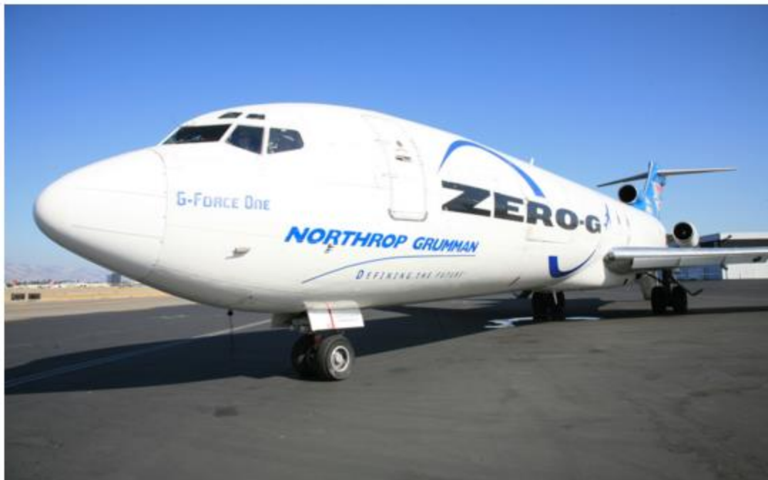
Zero Gravity Corporation

For an option in the U.S., head to Treehouse Point, in Fall City, Washington, just 30 minutes east of Seattle. A collection of tree houses fill the evergreen forest with overnight accommodations for up to 16 people, but the outdoor location itself can hold 80 guests.