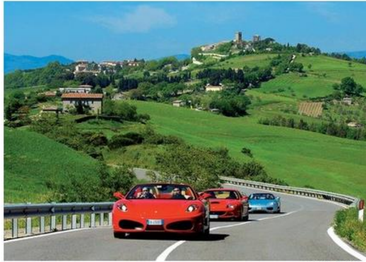
Food Valley Travel