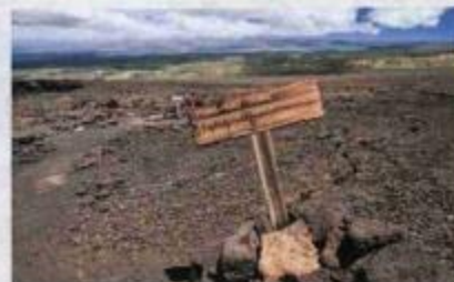
Clockwise from top: Visitors—and locals—soak up the sun on beautiful Kailua Beach; surfboards for rent on Waikiki Beach; Puna-kau Trail, with a view of Meuna Loa; Waikiki Beach is right in Honolulu!

CLOCKWISE FROM TOP: BREASTLINE; INTERALERT; PICTUREMARELLI; STEVE GOULD; FABIO PINERO