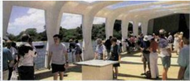
The USS Arizona Memorial at Pearl Harbor is a Honolulu highlight.

A shorter Hawaii option is "The Two Islander," a 7-day/6-night program (from $2,359, plus air) that ends on Day 7 of "The Three Islander." Either trip can be extended with a 3-night stay at the Hilton Waikoloa Resort on the Big Island of