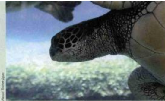
Hawaii's Turtles by Zepher

Students might encounter sea turtles on their snorkeling cruise.