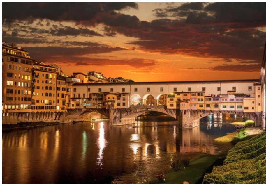
Sunrise over the river Arno and Ponte Vecchio in Florence, Italy.

For more information, visit contexttravel.com or contexttravel.com/access/create-agent-account .