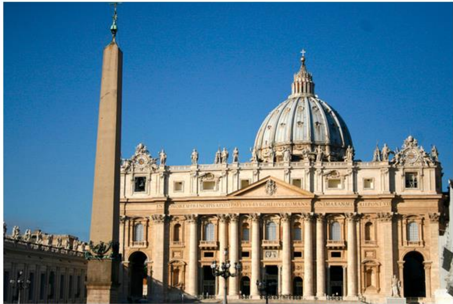
Views of St. Peter's while on the Director's Cut tour.

Explore the Ancient World with Voyages to Antiquity