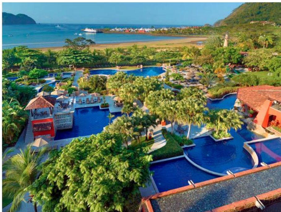
Los Sueños Marriott Ocean & Golf Resort.

While exploring new cities, cultures and cuisines, vacationers can immerse themselves in unique learning experiences. With packages ranging from wellness retreats to exploring a foreign land's art and film history, to even learning the local language, enriching experiences span the globe.