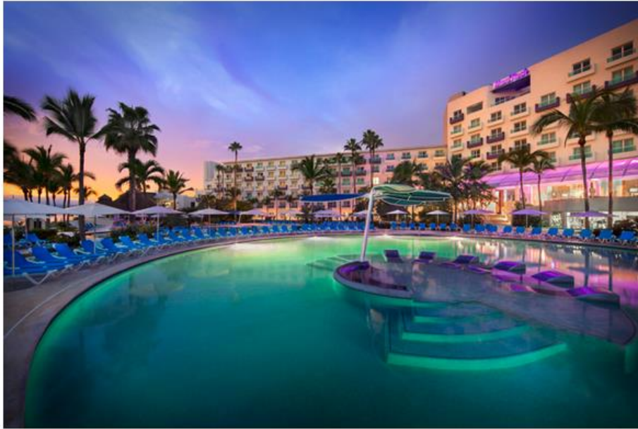
Hard Rock Hotel Vallarta part of the All Inclusive Collection.

For more information, visit learningjourneys.com/wellness/art-and-well-being-in-the-heart-of-tuscany .