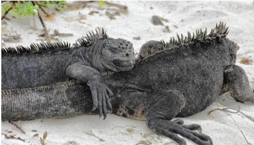
These marine iguanas on Santa Cruz Island in the Galapagos show it's not just humans that like to lie on the beach.