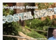
Costa Rica Through the Lens: 20 Pictures from Paradise TOUR OPERATOR