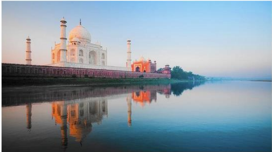
Take in the Taj Mahal while on a Nomadic Yoga Journey with Perillo Tours.