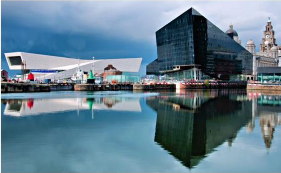
■ The Liverpool waterfront.

An hour's drive from Manchester's airport, the port town is perfect for pubbing, with hip bars and friendly locals. Hang out in the lobby of the Aloft Liverpool, where you can enjoy live music under the vaulted ceiling of the landmarked building. Upstairs, bright rooms have great skyline views (from $151 per night; aloftliverpool.com ).