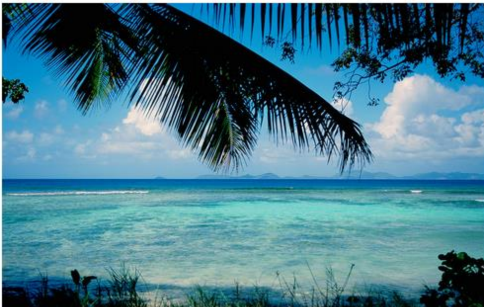
■ Mustique Island.

R&R is par for the course in the Caribbean, but this idyllic island takes it a step further with almost total privacy. Villa Collection rentals come with domestic staff and a golf cart—affectionately known as a mule—for use around the hilly terrain (from $5,250 per week for a one-bedroom villa; mustique-island.com/the-villa-collection ).