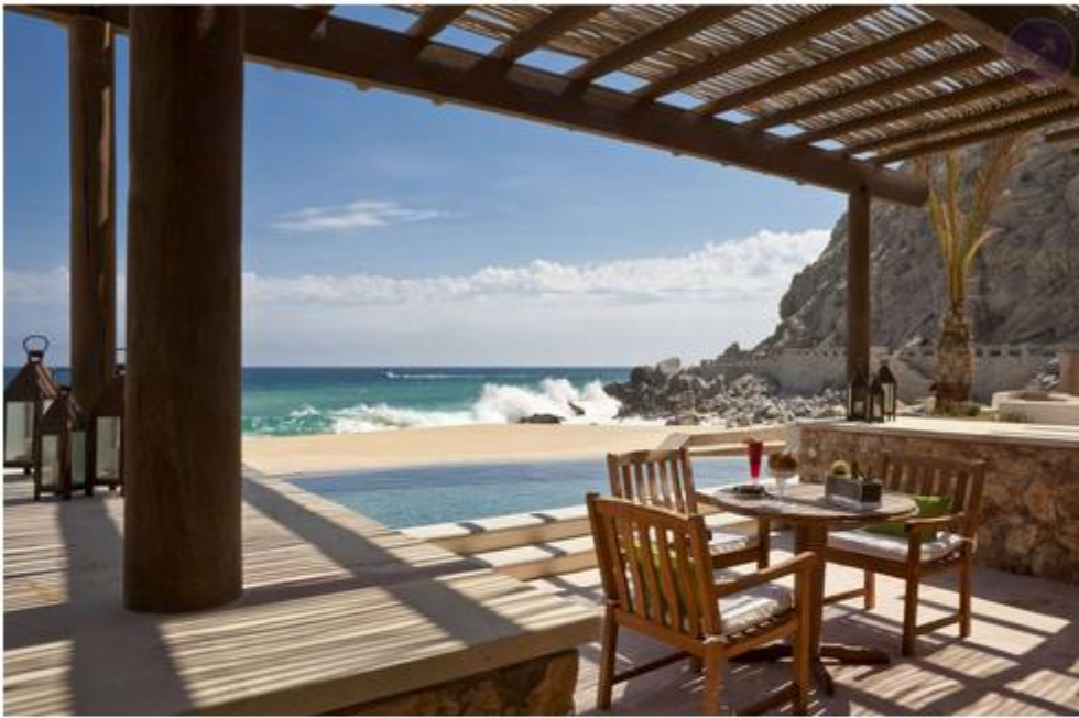
■ The Resort at Pedregal.

This beloved Baja getaway is three destinations in one: historic San Juan del Cabo, drunken Cabo San Lucas, and a strip of beachside resorts known as the Corridor. Get close to the action without having to be part of it at Cabo San Lucas's Resort at Pedregal. Rooms have private plunge pools and indoor fireplaces (from $775 per night; www.theresortatpedregal.com ).