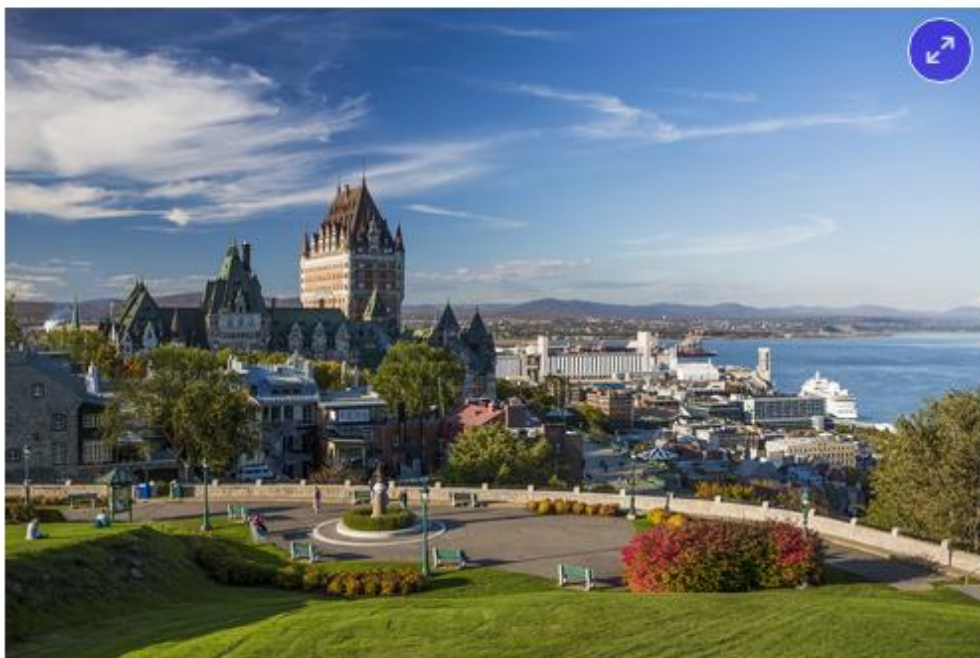
■ The Fairmont Le Château Frontenac.