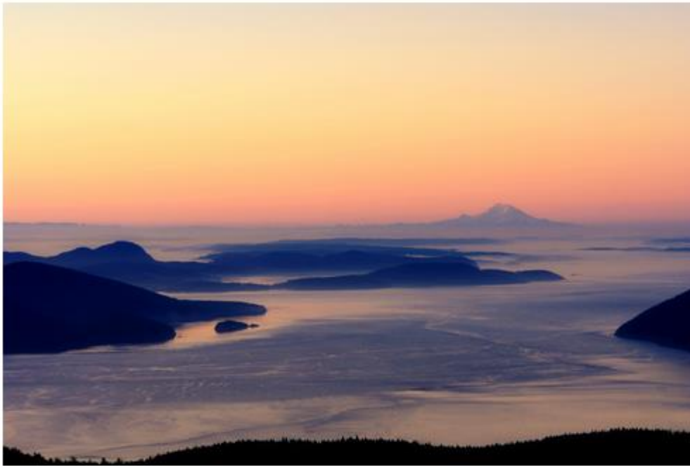
■ The view from the top of Mt. Constitution on Orcas Island.

Early fall is often Indian summer here, making it ideal for being outside. Just a 45-minute hop on a $127.50 seaplane from Seattle, the archipelago is a respite from city life. Center yourself at Orcas Island's Inn at Ship Bay, built around an 1860s farmhouse and tucked between heirloom pear orchards (from $125 per night; innatshipbay.com ).