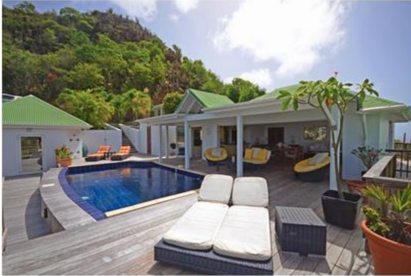
Villa Enfin is a two-bedroom villa in St. Barts

Share this article: http://lifelorb.es/1yrUHO2