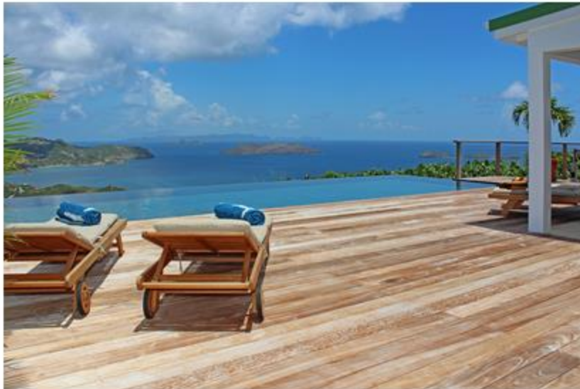
Villa Blue Diamond in St. Barts

Located in the hillside of Colombie, Villa Rocamdour features one bedroom, kitchen, dining area, living room and a guest bath. There is a covered area next to the pool for dining alfresco. Upstairs is private terrace, good for gazing at the stars at night. Prices start at $2,470 per week (versus $3,970 high-season accommodations-only during high season).