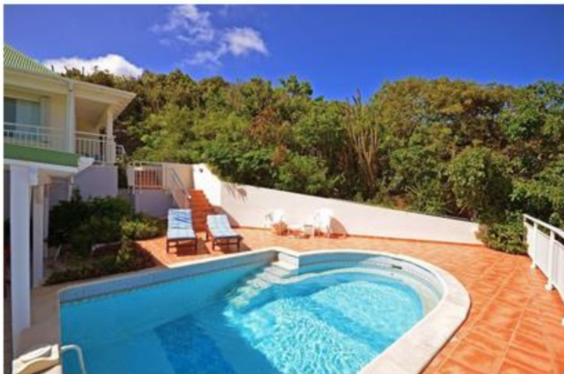
Villa Rocamdour in St. Barts

Located in the hillside of Colombie, Villa Rocamdour features one bedroom, kitchen, dining area, living room and a guest bath. There is a covered area next to the pool for dining alfresco. Upstairs is private terrace, good for gazing at the stars at night. Prices start at $2,470 per week (versus $3,970 high-season accommodations-only during high season).