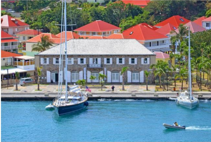
St. Barts' bustling capital of Gustavia, and its Wall House Museum.