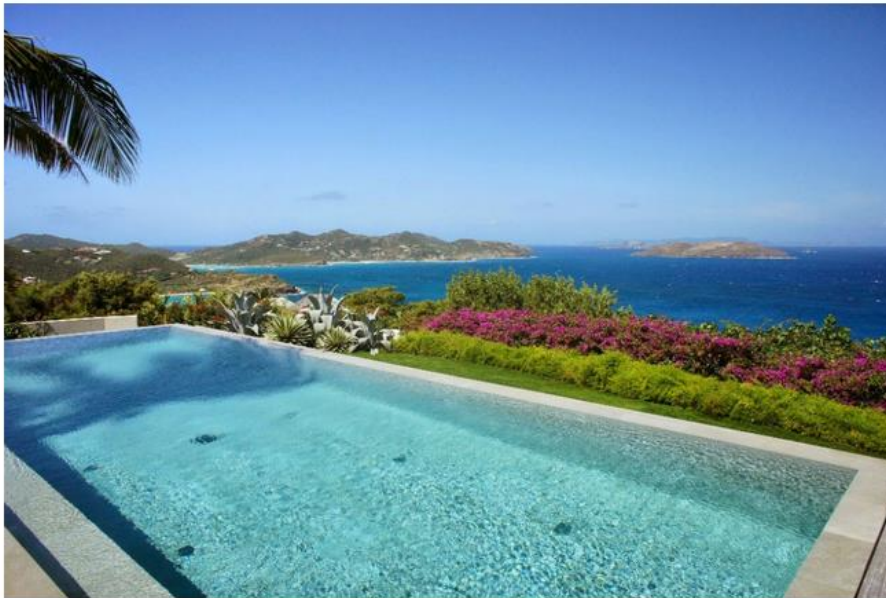
Stunning poolside and ocean views.