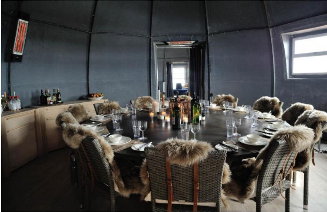
The White Desert Camp in Antarctica.