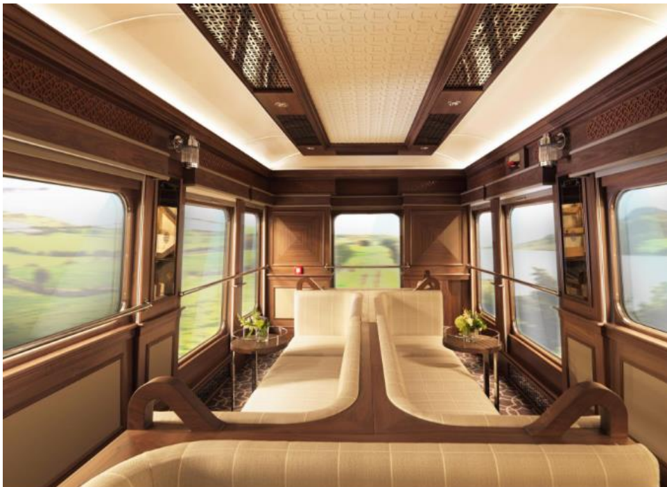
An observation car in the Grand Hiberian train.

Each of the 50 villas on this 13 acre island has its own pool, and some of the villas are located on stilts over the ocean. The island is part of the Baa Atoll, a UNESCO World Biosphere Reserve, which means the snorkeling is incredible. If you want to mix with the locals, you can go tuna fishing, but do you really want to go fishing when you have a private swimming pool? (Opening November 2016.)