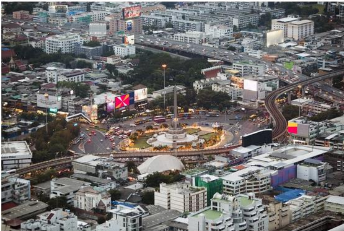
Traffic moves around the Victory Monument in the Ratchathewi district of Bangkok.