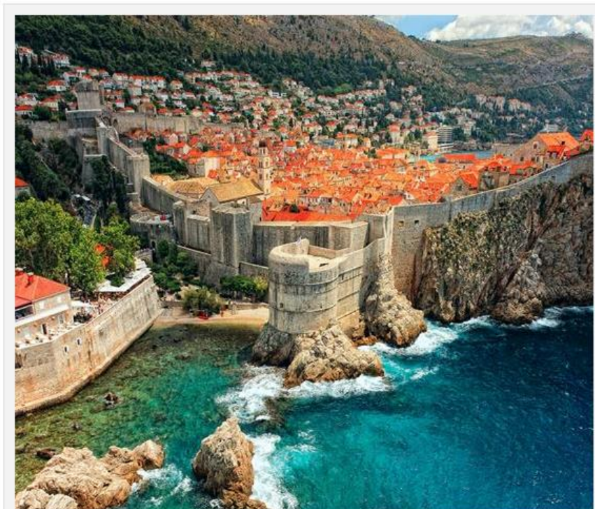
Dubrovnik, the real-life setting of King's Landing.

Game of Thrones super fans, take the ultimate Game of Thrones Croatian vacation with Zicasso. Zicasso is proud to introduce Game of Thrones: A Unique Tour of Croatia , a 7-day, guided immersion into the breathtaking locales of Split, Krka National Park, Hvar, Ston and Dubrovnik. While others may offer one-day trips to Game of Thrones filming locations, this week-long tour will introduce visitors to the wonders of Croatia, showcasing the best scenes from the beloved series as well as the historical and cultural highlights of this beautiful destination.