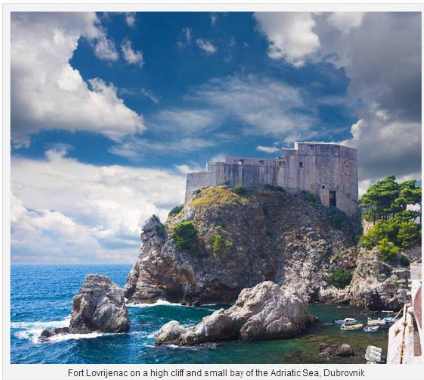
Fort Lovrijenac on a high cliff and small bay of the Adriatic Sea, Dubrovnik