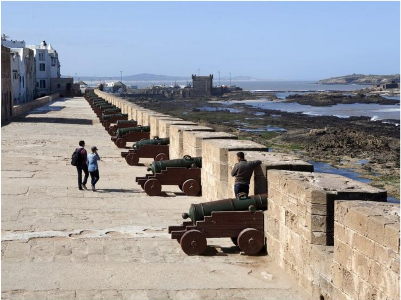
Look familiar? Morocco's Essaouira, a UNESCO World Heritage Site, was the filming location for Astapor, "Game of Thrones"' infamous slave-trading city.